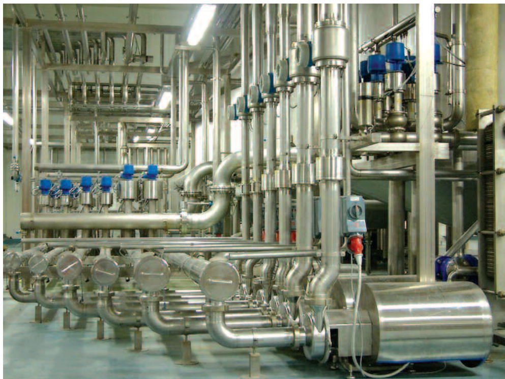
The integrated filter dryer features an integrated fluid bed and filter arrangement.

Using the units of measure used for outlet humidity (lb lb), every contributing component is measured. This means measuring