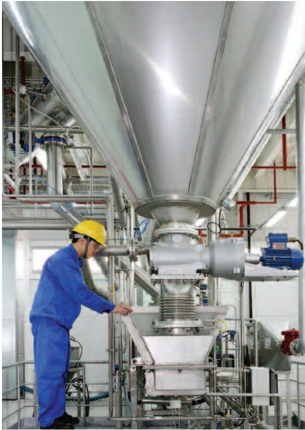
A service technician with a spray dryer

cyclones. Even if a plant does not need all 720 hours, operating in the most efficient way possible leads to labor savings. If the dryer feed system is down for cleaning, dryer downtime results, reducing the amount of available time in a production month. In a food or dairy plant, the feed system for the spray dryer often must be washed or CIPed daily. In food plants that often switch between products, batches and products must be separated. A hot issue is dealing with allergens and cleaning between allergen classes. Many simple incremental operational improvements can be made in the feed-system CIP to shorten turnaround times. For example, is the labor required to remove nozzle lances from the spray dryer and hook them up for cleaning proceeding as efficiently as possible? A second set of nozzle lances that has been pressure tested and is ready for installation will save operators from having to cover the same ground twice.