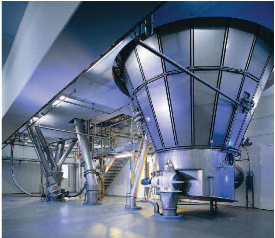
A large dairy multistage dryer with insulation panels that can provide substantial energy savings

monthly basis. In a 30-day month, there are 720 hours during which a dryer can run. How many hours per month is it in fact running? How many hours per month are lost to clean in place (CIP)? How many hours are lost to process-related problems such as a plugging, build-up, etc.? In many cases, more production can be achieved by reducing downtime than by trying to operate each production hour close to the theoretical maximum. The third, and often overlooked, approach is to maximize dryer production on an annual basis based on changes in ambient conditions. Spray dryers almost always run better in winter than in summer. This has to do with the amount of moisture in